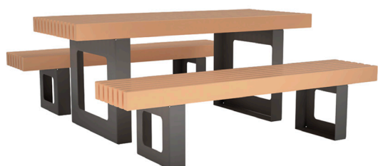
METTRO 106 - 64106 - Picnic BenchCombination