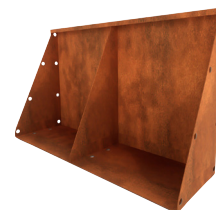
Retaining wall pot straight