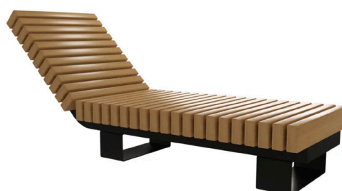
METTRO 115- 64115 - Lounger