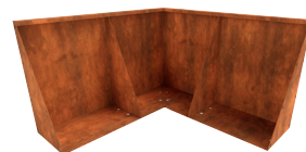
Retaining wall pot corner