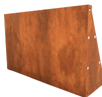
Planter pot straight